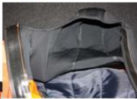
Cuffs and hood soft-coated in order to prevent water from slipping into the suit.