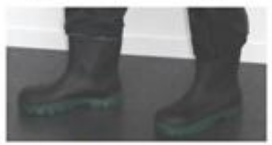
Fixed hard toe boots