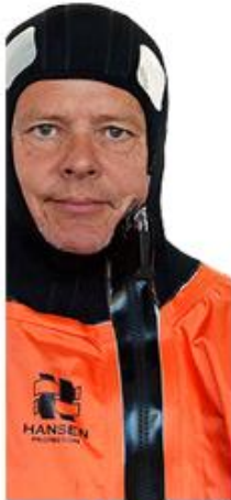
High quality TIZip soft nylon zipper to ease donning.