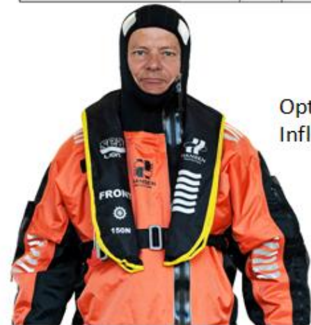
Optional 150N and 275N Inflatable SOLAS lifejackets