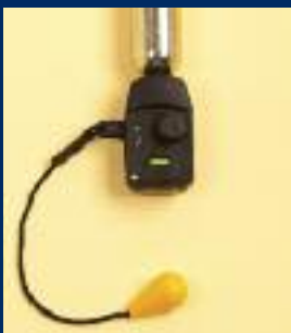
UM Manual Pro