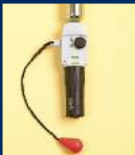
UM Auto Pro