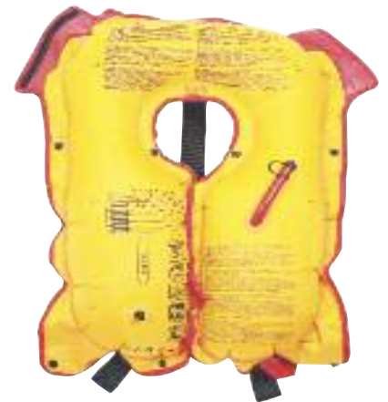
Integral bladder 150N for C19 only