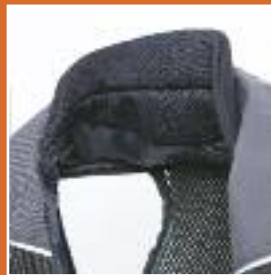
Neoprene neck for added comfort

Jackets can be trimmed with contrasting hems e.g. Blue on Red, Black on Orange to suit your requirements and we can also fit linings which incorporate reflective thread to aid location in low light conditions.