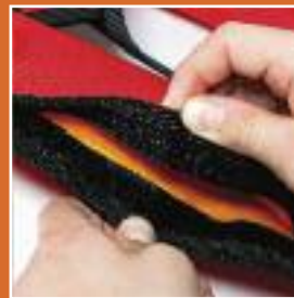
Hook and loop press closure