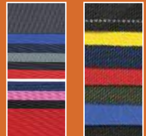
Colour and hem options