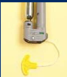
HR Pro 1F Auto