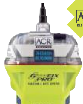
ACR GlobalFix™ iPRO

As well as ISP products, you can also view and order the full range of products from our Partners in Safety, Cyalume and ACR Products by visiting our website: