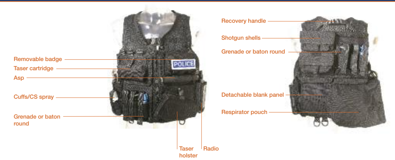
Removable badge Taser cartridge Asp