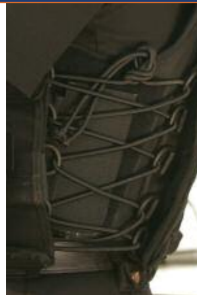
Side adjustment assures one size fits all